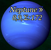
Neptune >> 8,9, Σ:172