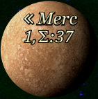
«Merc 1, Σ:37