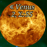
« Venus 2, Σ:55