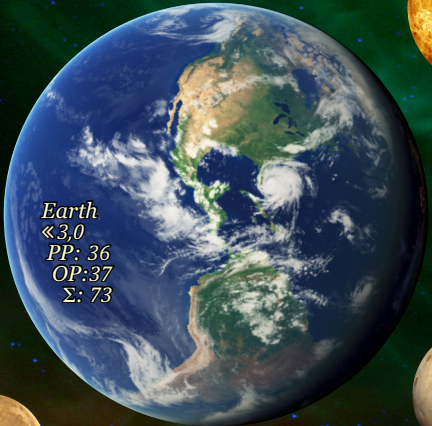
Earth «3,0 PP: 36 OP:37 Σ: 73