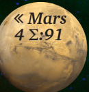
« Mars 4 Σ:91