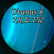
Uranus >> 7,8, Σ:152