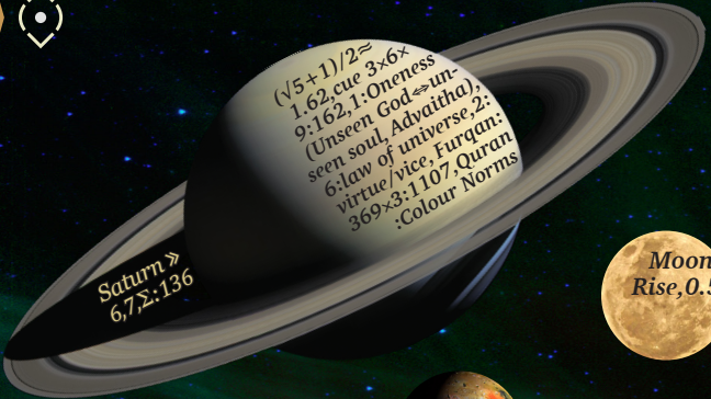
Saturn >> 6,7, Σ:136

(\sqrt{5}+1)/2 \approx 1.62 , cue 3×6×9:162, 1-Oneness (Unseen God ↔ unseen soul, Awaitha), 6:law of universe, 2: virtue/vice, Furqan: 369×3:1107 Quran :Colour Norms