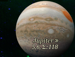
Jupiter >> 5,6, Σ:118